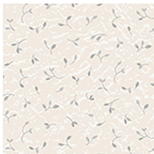
0531-1042 Background for Blocks A, B, C, D, E, and Irish Chain Sawtooth Blocks 1 ¼ yards