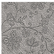
0532-1043 Irish Chain Blocks and Appliqué ½ yard