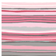
0556-1025 Inner Border and Binding ¾ yard