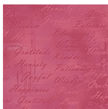
0528-1031 Blocks A, B, C, D, E, and Irish Chain Sawtooth Blocks ½ yard