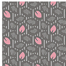
0527-1044 Block A, E, and Appliqué 1/4 yard