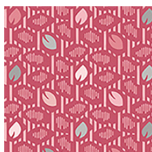
0527-1024 Block B, E, and Appliqué ¼ yard