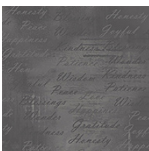
0528-1043 Blocks B, C, D, and Appliqué ¼ yard